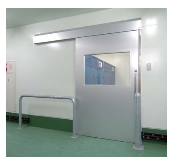
Example of use in a factory